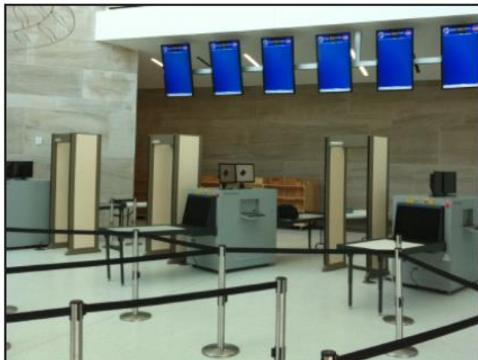
Courthouse in USA

Astrophysics is headquartered in the United States, but boasts multiple field offices worldwide for localized support. We also retain a dedicated Sales and Service Team dedicated to a personalized and timely response 24/7. Contact your Astrophysics Sales Representative today to learn more.