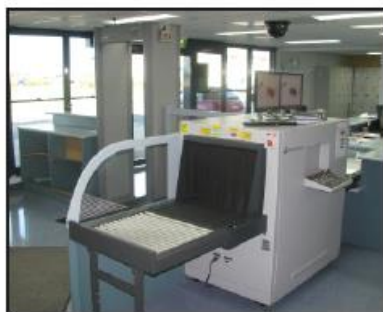
Prison in Australia